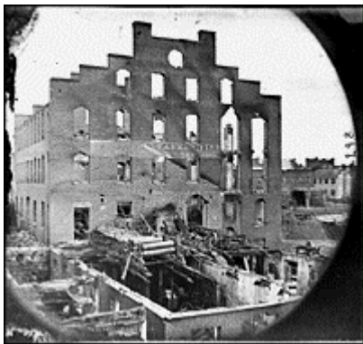
April 1865 – ruins of paper mill, Richmond, VA.