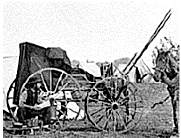
Cold Harbor, Va. Photographer's wagon and tent Between 1860 and 1865

Exposure of the plate and development of the photograph had to be completed within minutes; then the exposed plate was rushed to the darkroom wagon for developing. Each fragile glass plate had to be treated with great care after development -- a difficult task on a battlefield.