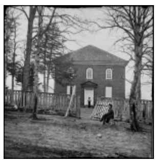
Falls Church, VA The Church

Sacramento Civil War Round Table P.O. Box 254702 Sacramento, CA 95865-4702