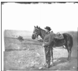
Antietam, Md. A cavalry orderly